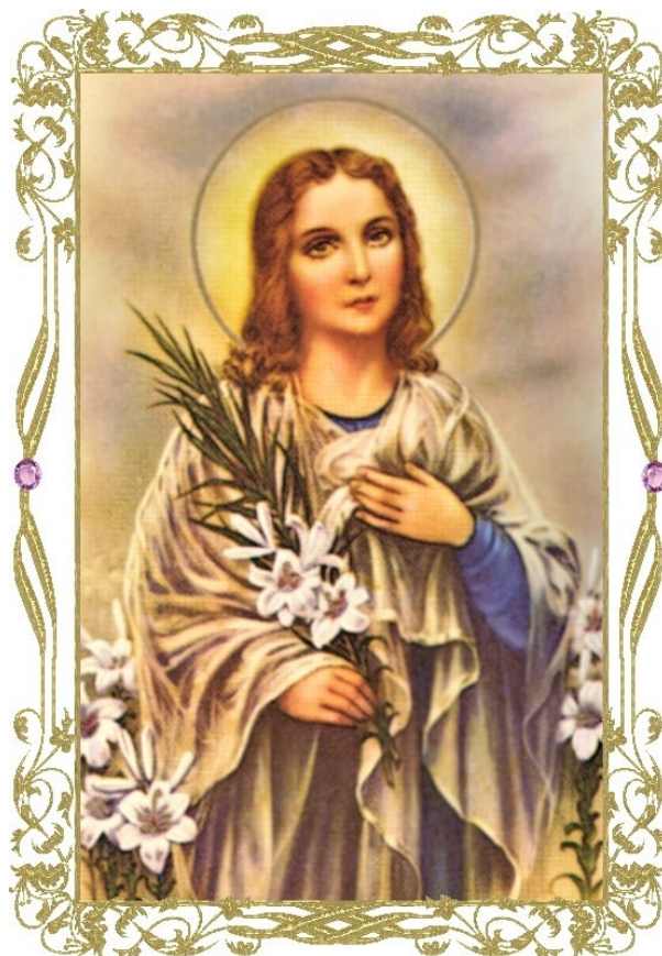
Saint Maria Goretti

Oh Saint Maria Goretti who, strengthened by God's grace, did not hesitate even at the age of twelve to shed thy blood and sacrifice life itself to defend thy virginal purity, look graciously on the unhappy human race which has strayed far from the path of eternal salvation. Teach us all, and especially youth, with what courage and promptitude we should flee for the love of Jesus anything that could offend Him or stain our souls with sin.