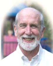
Retired Priest ~ Sacerdotes Jubilados ~