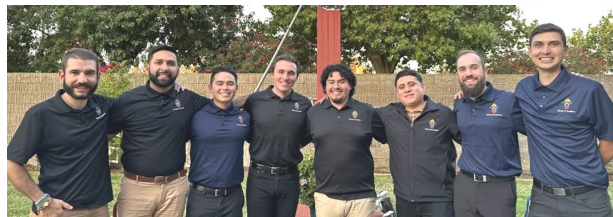
Seminarian Education ~ Educación de los Seminaristas ~