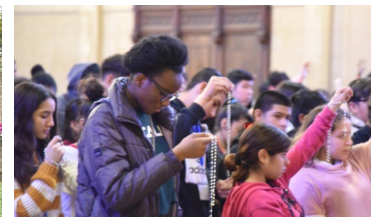
Youth & Young Adults Jóvenes & Jovenes Adultos