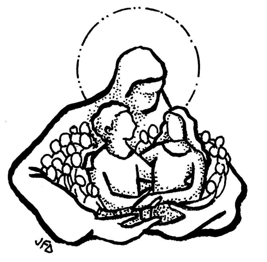
May 19, 2019